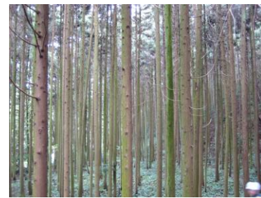
Photo-1 Forest not maintained properly in Shiga Prefecture

Nearly 67% of Japan’s land area is Forest. About 41% of this are planted forest that need maintenance. However, recently efficient wood use at the planted forest is not conducted. The other hand, wood is reviewed as building material for house construction. There are some activities for local wood use. But actually the activities are not progressing (Photo-1). Why isn’t that progressing? The study objective is to grasp and analyze the current situation, and know the reason.