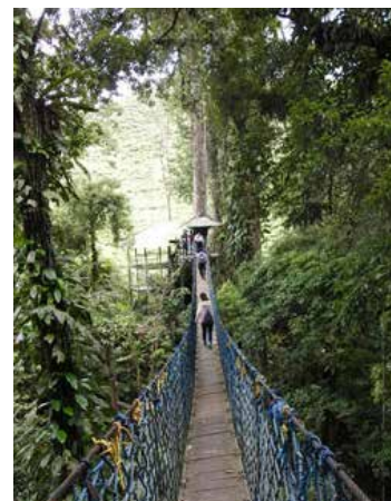
A canopy bridge in the ocean of trees