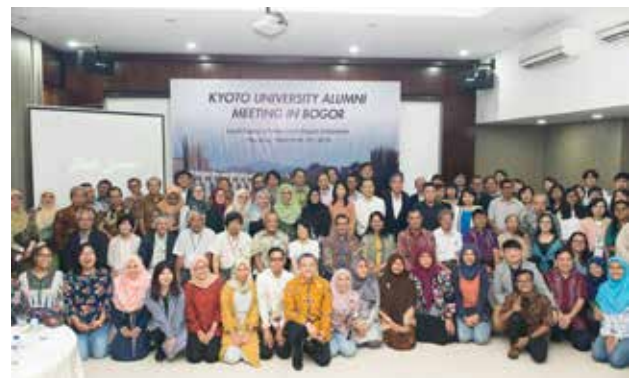
Group photo showing all participants