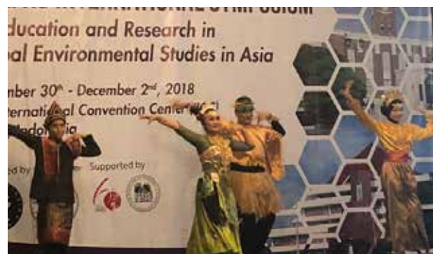
Nusantara Dance performed by the IPB students

Nusantara, performed by the IPB students themselves, and this brought the 2-day symposium to a successful conclusion.