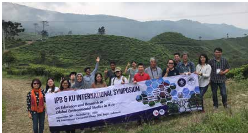
A group photo in front of the tea plantation