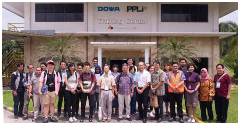
Group photo showing all participants in front of the training center of the PPLi company

です。最も多く受け入れているのは種々の産業で発生する汚泥であり、重金属など有害成分を多く含んでいるため、安定化処理を行った上、2009年から運営している管理型埋立処分場で埋め立てています。PPLi社の全体説明を受けたのち、質疑応答の時間を長くさせていただき、さらに、埋立処分場を含め、現地の見学を行った後、昼食も振る舞われました。全体として、インドネシアの廃棄物処分の現状も含め、活発な議論がなされるとともに、参加者の間の交流もあり、大変有意義なスタディツアーとなりました。ツアーの受入に協力いただきましたPPLi社、および関係各位に感謝いたします。