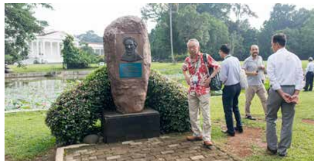
Monument commemorating the founder and the first director, Caspar Georg Carl Reinwardt, a Dutch botanist

Just like the local people, by breathing in the fresh morning air, the visitors had a lovely stroll along the garden tracks and a nice cup of morning tea; a great start to an enjoyable day.