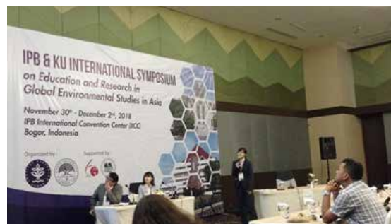
Presentation by young researchers

サブセッション2では若手研究者による口頭研究発表を行いました。発表者は元留学生を中心に日本、インドネシア、ベトナム、フィリピンの大学で研究する若手研究者計10名であり、地球環境問題について様々な視点から行われた研究内容を発表していました。発表時間8分、質疑応答5分と限られた時間の中、参加者から多くの質問があり、発表内容に対する高い関心が伺えました。