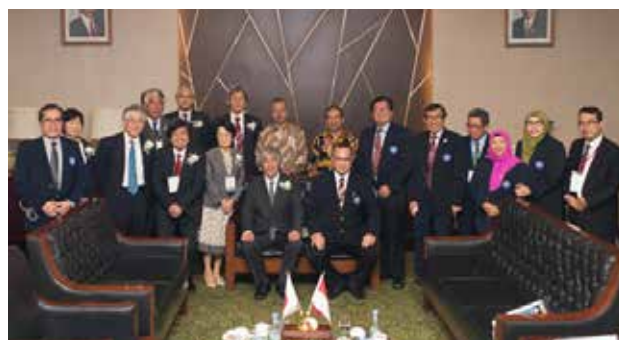
Group photo of all those taking part in the courtesy visit