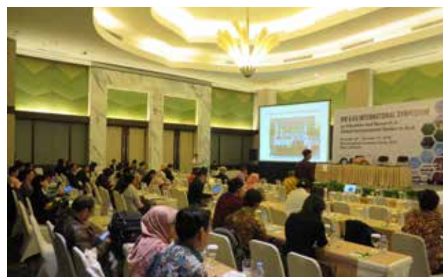
Discussion in sub-session 5