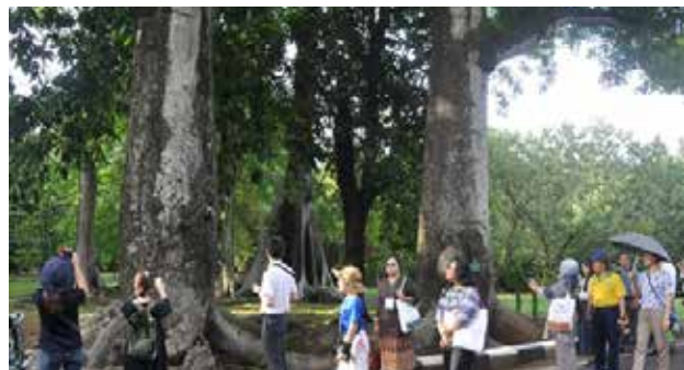
Giant tropical trees inside the gardens

In the morning of December 1, before the sessions began, the participants paid a visit to Bogor's botanical gardens, which are located not far from the IPB International Conference Center (IICC). As the gardens adjoin the presidential palace, this has made them quite famous. They cover an extensive area of about 87 hectares and contain over 13,000 species of trees and plants. Since it rains almost every day in Bogor, even in the dry season, it makes the gardens a perfect place for the cultivation of tropical plants. Participants were surprised and enchanted by forests consisting of a wide variety of gigantic trees. In addition to the tropical environment, the participants also enjoyed learning about the long history of the gardens. There are many monuments scattered around the gardens that tell stories about the gardens, some of