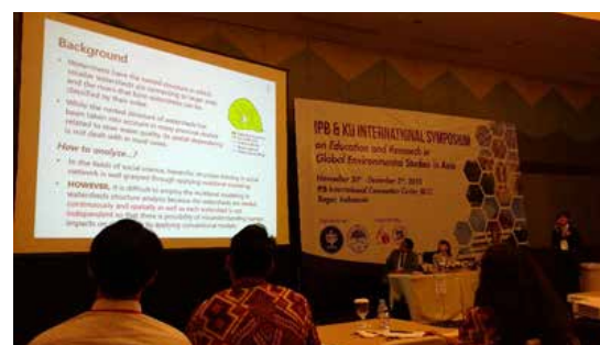
Presentation by young researchers