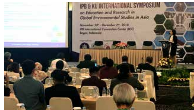
Research presentation by a student