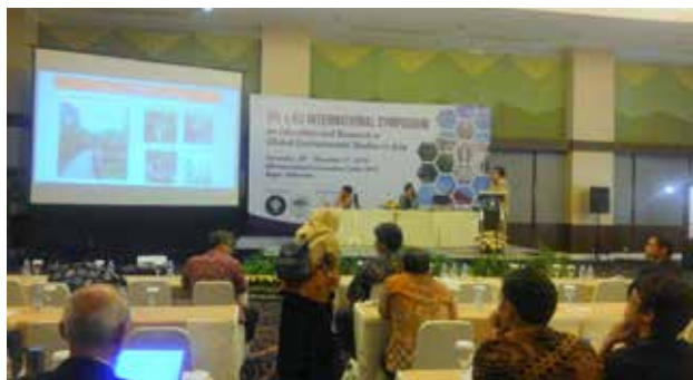
Discussion in the subsession 4

focusing on their distribution and local knowledge of this species. The last four speakers reported on coastal forest ecosystems. Prof. Cecep Kusmana (IPB) addressed the sustainable utilization of mangrove forest products and their contribution to local communities. Prof. Bambang H. Saharjo (IPB) reported on peat fires in Indonesia and the various challenges in reducing the risk of peat fires in this country. Prof. Kanzaki (KU) gave a presentation looking at the productivity of small scale sago palm plantation on peatlands and discussed the high potential of sago palm for sustainable peatland utilization. Lastly, Dr. Syaiful Anwar (IPB) reported the current condition of peatlands and challenges associated with the reclamation and sustainable management of peatlands. The sub-session was chaired by Prof. Hendrayanto (IPB) and Prof. Kanzaki (KU), and the participants, which included young scientists, engaged in lively and ardent discussions. The sub-session contributed to deepening and expanding the collaboration between Indonesian and Japanese scientists and was brought to a successful conclusion.