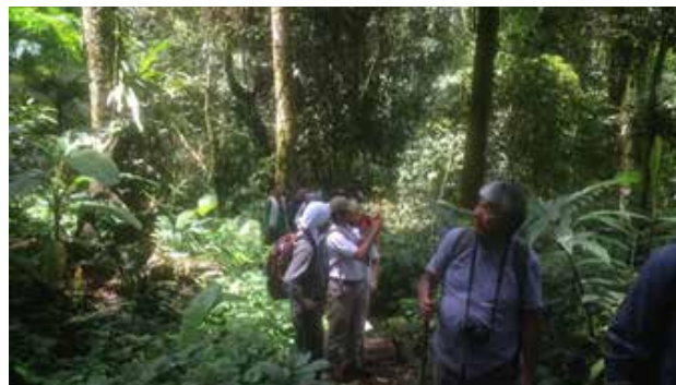
Trekking inside the rainforest

this, everyone enjoyed the tour very much. Inside the forest, we also went on a small adventure by crossing a canopy bridge built between trees, about 20 meters above the ground. The construction of this canopy bridge had been supported by Japan. Later, we also enjoyed traditional Indonesian foods prepared by local farmers, surrounded by exotic and peaceful tropical highland culture.