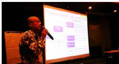
Ministry of Land, Infrastructure, Transport and Tourism, (MLIT), Japan and JICA Expert.