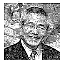
Purdue University Distinguished Professor Mr. Ei-ichi Negishi (Teijin Group Distinguished Fellow) 5th year Teijin Kumura scholarship (1957)

When you find your own "Dream", please challenge it thoroughly until the truth is investigated. I look forward to your great success in the future.