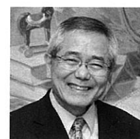
Purdue University Distinguished Professor Mr. Ei-ichi Negishi (Teijin Group Distinguished Fellow) 5th year Teijin Kumura scholarship (1957)

When you find your own "Dream", please challenge it thoroughly until the truth is investigated. I look forward to your great success in the future.