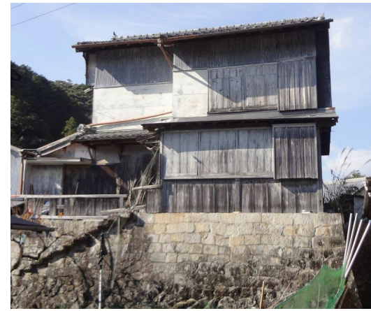
Evacuation shelter called "Agariya"