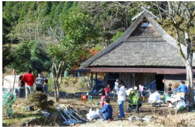
Village revitalization of Oisako area in Natasho