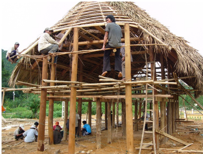
Rebuilding a community house