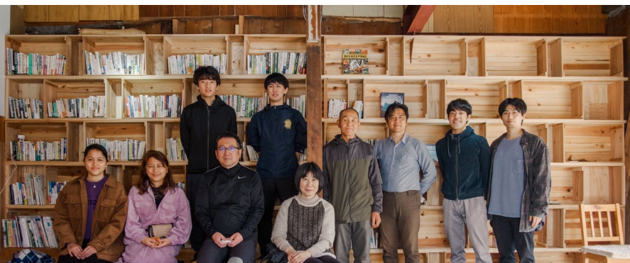
Renovation of vacant house project "Satellite Koza"