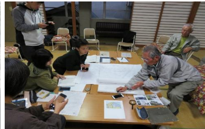
Interview survey of traditional knowledge on disaster