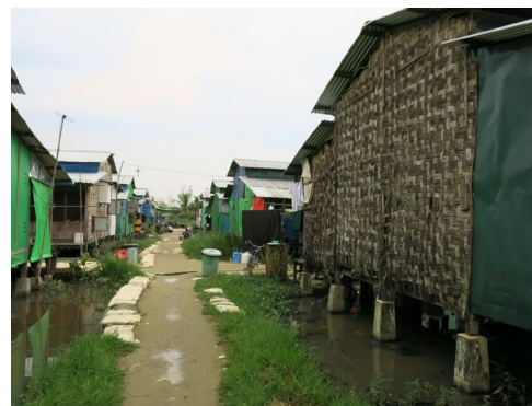
Yangon social housing project