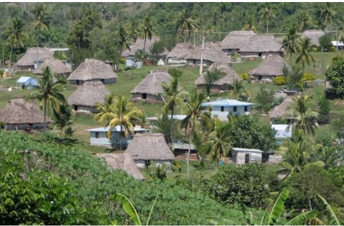
Vernacular architecture and cyclone disaster in Fiji

The research explores "knowledge and practices for sustainable harmonious human living", through knowledge gained from local settlement that coexisted with nature and historical towns that encompasses cultural diversity.