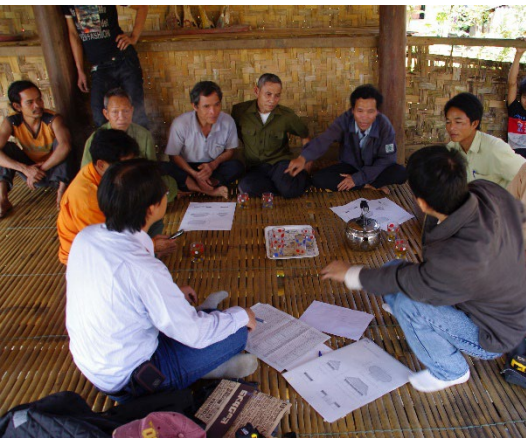
Interview survey of indigenous construction technology