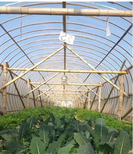
Bamboo green house project

The research explores “the environmental architecture” and “the social design” for rebuilding and sustaining current human living condition. Findings and experiences contribute to practical applications for local communities.