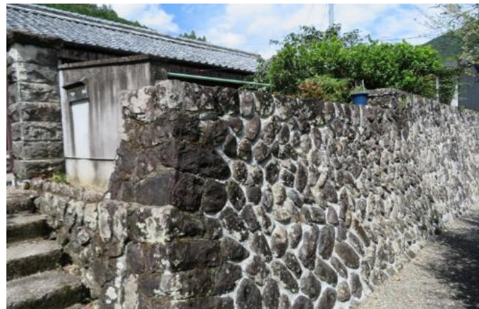
Windbreaks stone wall village