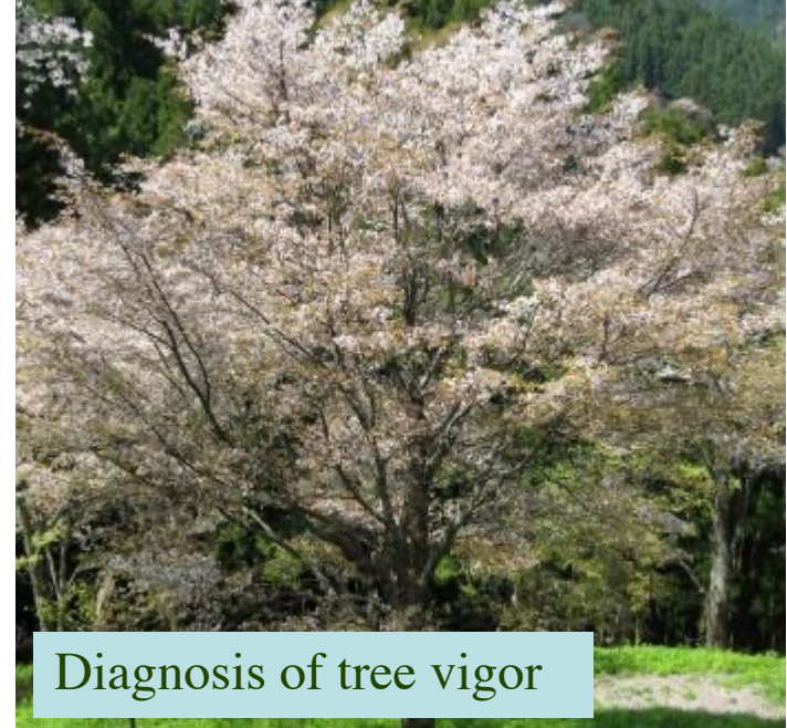
Diagnosis of tree vigor