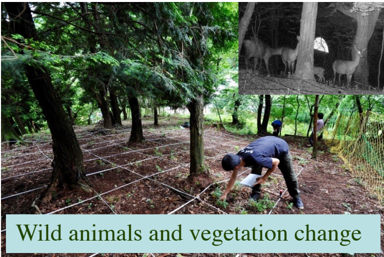
Wild animals and vegetation change