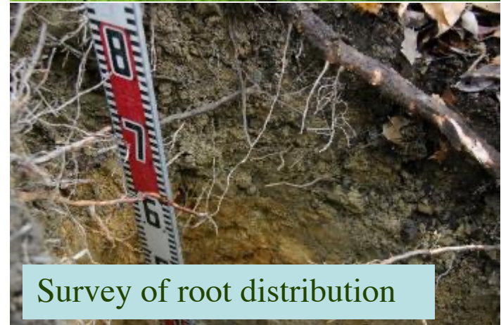
Survey of root distribution