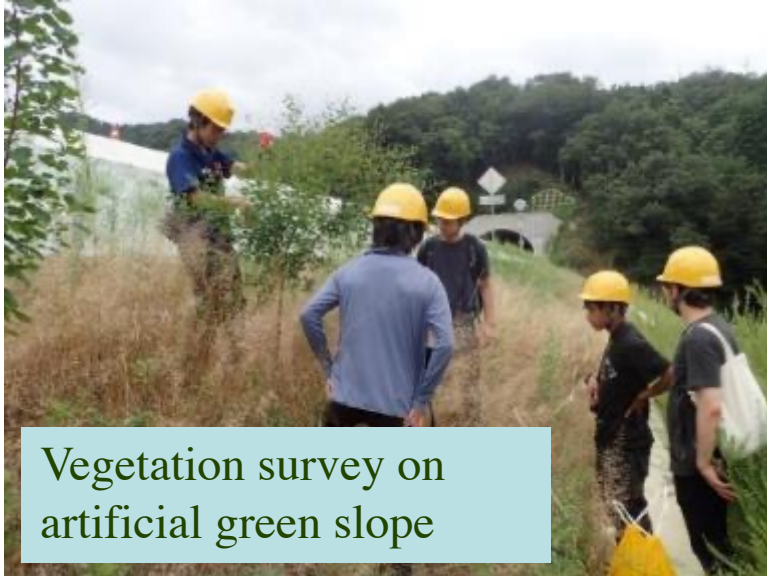
Vegetation survey on artificial green slope