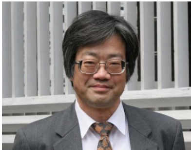
Shozo SHIBATA (Prof.)

Keywords: urban area, rural area, Satoyama, cultural landscape, landscape planning, biodiversity conservation, ecosystem management, nature restoration, revegetation